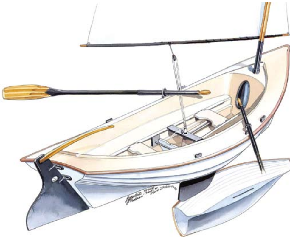
The Boat—Gig Harbor Melonseed. LOA: 16'5" BEAM: 64" DISPL: 195lb www.ghboats.com Illustration by Tadami permitted by KAZI Co.,Ltd.

parently, fishing in the confluence of the Queets River, a few hundred meters south, was more interesting than some random human flotsam.